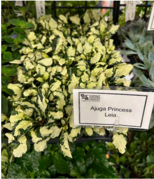
Ajuga reptans 'Princess Leia'