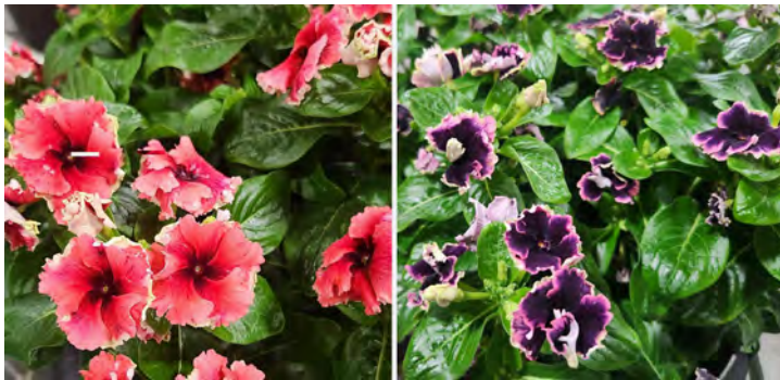
Catharanthus hybrid Soiree Flamenco Electric Salmon Eye & Plum Velvet

Suntory/Sun-Fire Nurseries 4-17-5 Shiba Minato-ku Tokyo 108-0014 Japan Tel: 440-522-1447 http://www.suntoryflowers.com/