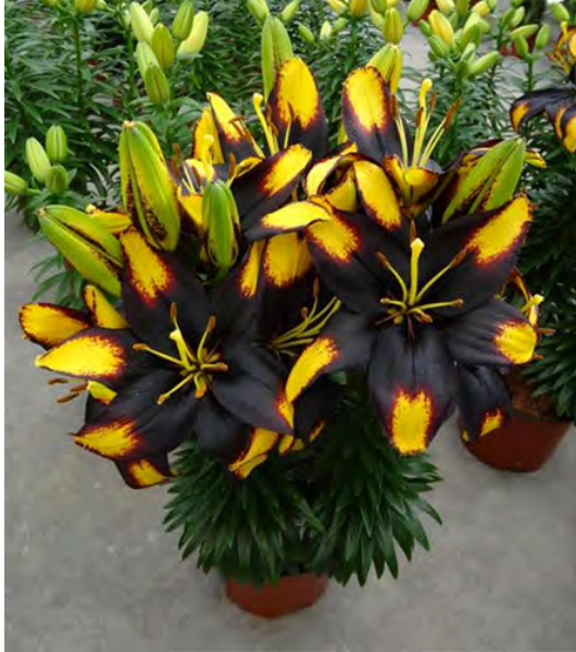
Lilium - Asiatic Lily Looks 'Tiny Massive'