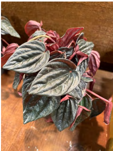
Peperomia caperrata 'Brasillia'

Simon Vestdijkstraat 17 Wageningen, Gelderland 6708NW Netherlands Tel: 407-920-9855 www.succulentsunlimited.com travis@succulentsunlimited.com