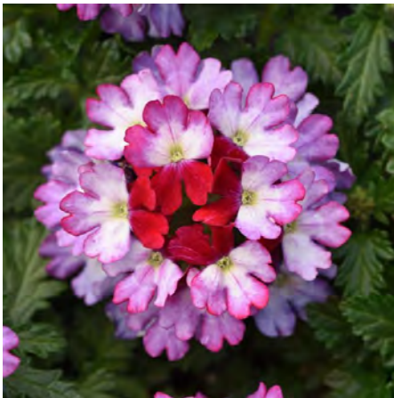
Verbena Beats™ Series 'Purple+White'

622 Town Rd West Chicago, IL 60185 USA Tel: 630-231-3600, Fax: 630-580-8290 www.selectanorthamerica.com jgibson@ballhort.com